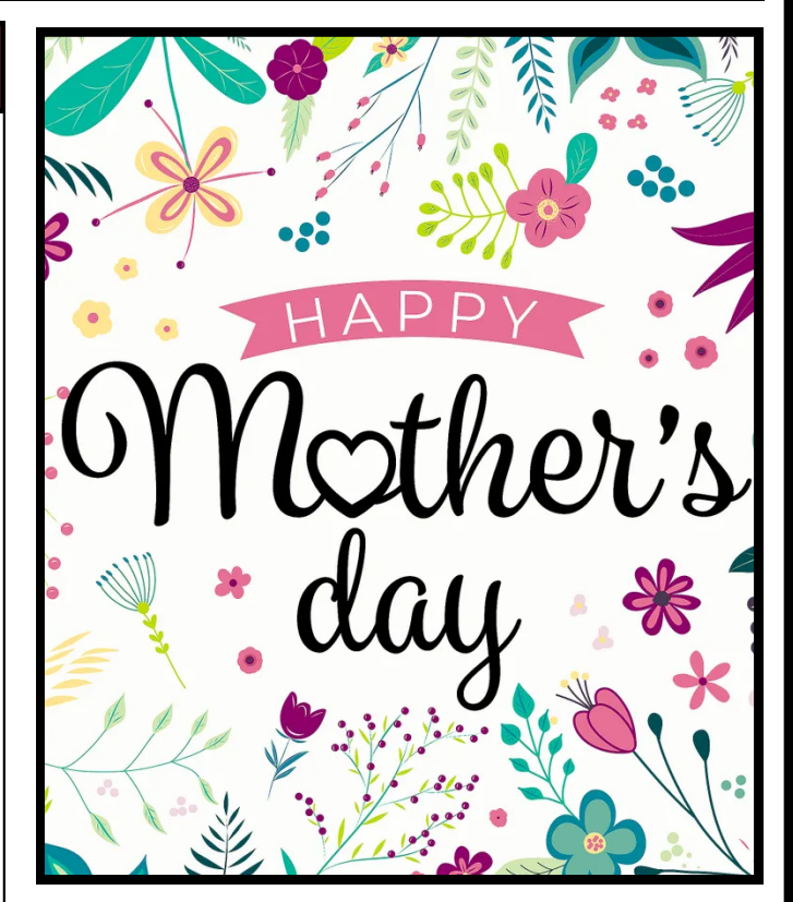
Don't forget: Mother's Day is May 11

Mother's Day: This Sunday, May 11th, don't forget to show love to the moms, mother figures, and guardians who support us every day. Behind every individual, there is a strong guardian who has supported us, so it's time to show them some love. Whether it's a heartfelt card, a hug, or just doing the chores without being asked, small things matter, and those small things make their life easier. The EarlyBard recommends going beyond these small things, maybe pick her favorite movie, cook her breakfast in bed, or go enjoy outside with her! Let's appreciate the women who raised us, cheered us on, and not only celebrate them on this day but every day for their hard work.