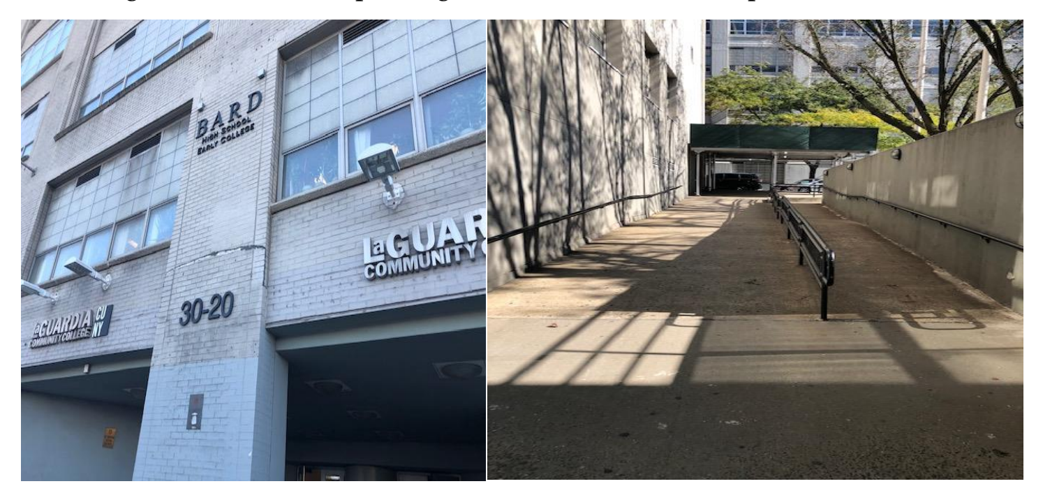
(Thomson Avenue entrance)

There are two entrances to Bard. One on Thomson Avenue and one on 47<sup>th</sup> Avenue. I will enter on 47<sup>th</sup> Avenue which is the entrance in the middle of the block, right in front of the parking lot. There is also a ramp at this entrance.