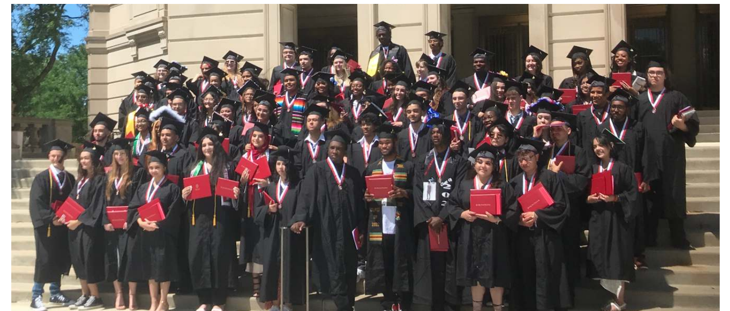
Class of 2022 Cleveland

BEC is grounded in the belief that access to college should be determined by a student's ambitions – not limited by their age, zip code, or the price of admission. Through participation in the Open Society Foundation's challenge grant of $500 million to Bard College's endowment, gifts received to create an endowment for BEC campuses were eligible to be matched dollar-for-dollar. This extraordinary opportunity made it possible for BEC to begin building an endowment, securing the future of our work and ensuring its lasting impact for young people.