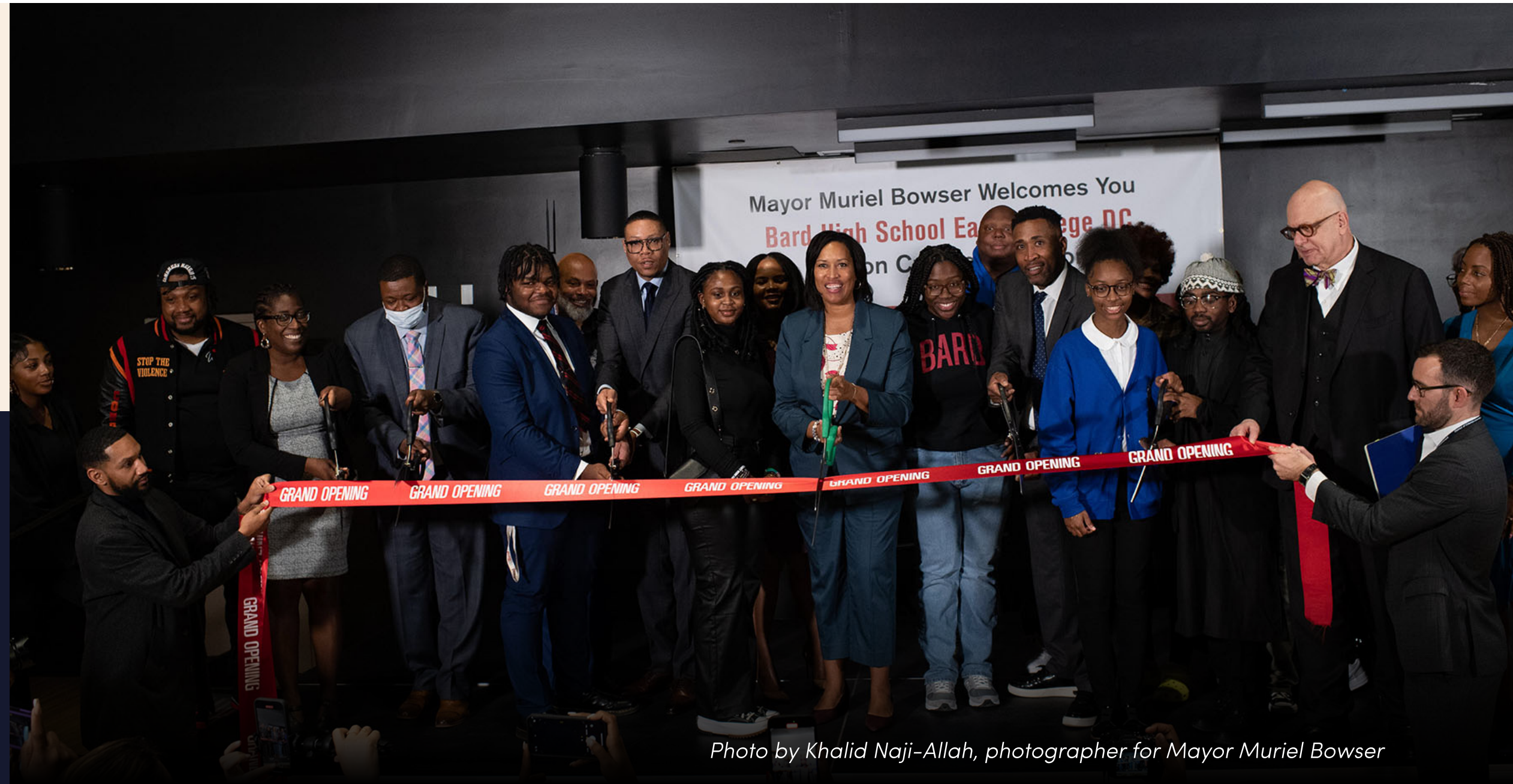
photographer for Mayor Muriel Bowser